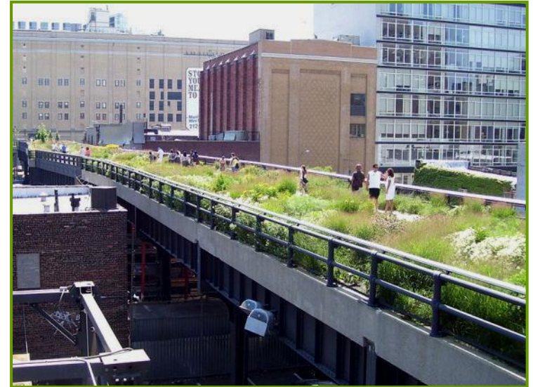
The High Line in New York City