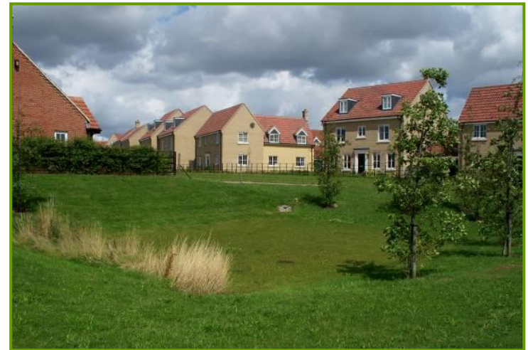
Lamb Drove detention basin ↑, swale ↓